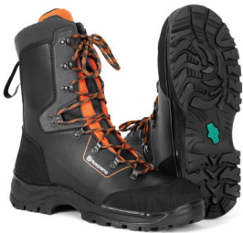
PROTECTIVE BOOTS - (LEATHER) WITH SAW PROTECTION C20 SIZE - EU 43, AU/NZ 9 597 65 94-43