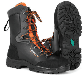
PROTECTIVE BOOTS - (LEATHER) WITH SAW PROTECTION C20 SIZE - EU 42, AU/NZ 8 597 65 94-42