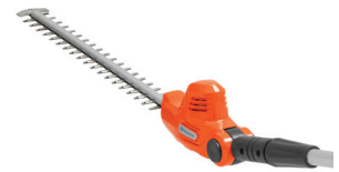
HUSQVARNA HEDGE TRIMMER ATTACHMENT - BATTERY SERIES HK4 529 35 19-02