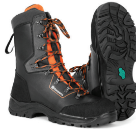
PROTECTIVE BOOTS - (LEATHER) WITH SAW PROTECTION C20 SIZE - EU 41, AU/NZ 7.5 597 65 94-41