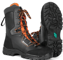
PROTECTIVE BOOTS - (LEATHER) WITH SAW PROTECTION C20 SIZE - EU 47, AU/NZ 12 597 65 94-47