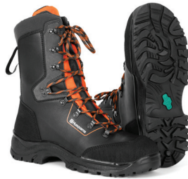
PROTECTIVE BOOTS - (LEATHER) WITH SAW PROTECTION C20 SIZE - EU 40, AU/NZ 6.5 597 65 94-40