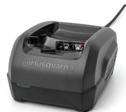
QC250 BATTERY CHARGER 967 97 01-05