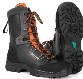
PROTECTIVE BOOTS - (LEATHER) WITH SAW PROTECTION C20 SIZE - EU 45, AU/NZ 10.5 597 65 94-45