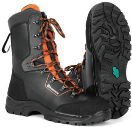
PROTECTIVE BOOTS - (LEATHER) WITH SAW PROTECTION C20 SIZE - EU 39, AU/NZ 5.5 597 65 94-39