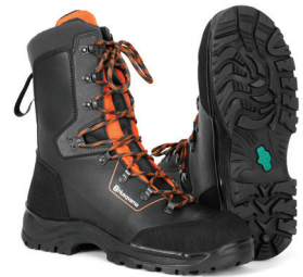
PROTECTIVE BOOTS - (LEATHER) WITH SAW PROTECTION C20 SIZE - EU 46, AU/NZ 11 597 65 94-46