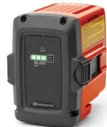
BLI20 BATTERY 967 09 17-01