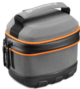
BATTERY BAG 585 37 18-01