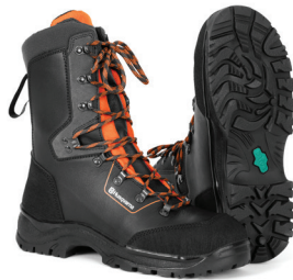
PROTECTIVE BOOTS - (LEATHER) WITH SAW PROTECTION C20 SIZE - EU 44, AU/NZ 9.5 597 65 94-44