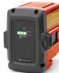
BLI10 BATTERY 967 09 16-01